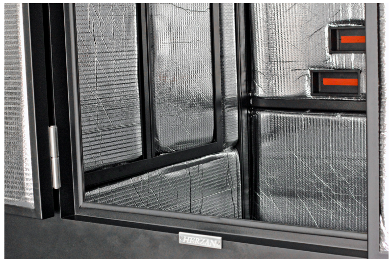
Internal view of enclosure: high quality hardware, 360° access, and industry leading performance

External Dimensions (W x D x H): 52 x 60 x 83.5 in. / Internal Dimensions (W x D x H): 48 x 56 x 80 in.