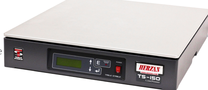
TS-150 Active Vibration Isolation Table

TS Series tables provide industry leading active vibration isolation performance (sub 1 Hz), helping users achieve more from their research by removing disruptive vibration noise from their measurements.